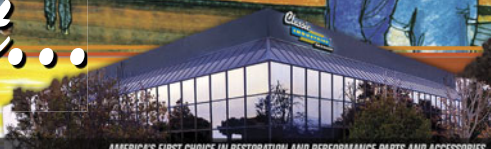
AMERICA'S FIRST CHOICE IN RESTORATION AND PERFORMANCE PARTS AND ACCESSORIES